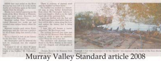
Murray Valley Standard article 2008